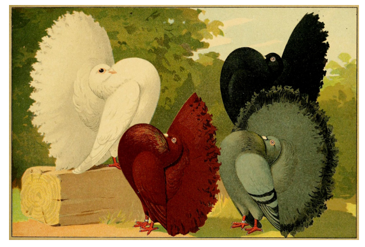
Some "fancy" pigeons (public domain; illustration by Anton Schöner, Wikimedia Commons)^6

long time, suddenly there will be what they called a "reversion" or "atavism" – a case where the animal suddenly snaps back to being like a very distant ancestor (like a pigeon that you'd see in the street).