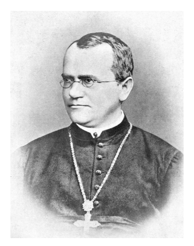
Gregor Mendel, from Bateson (1902; public domain; Wikimedia Commons)<sup>1</sup>

As you probably all know by now, a monk named Gregor Mendel (1822-1884) performed a series of experiments in the middle of the nineteenth century on a variety of characters in peas – experiments that would later become central in the development of the science that we now call genetics. Mendel showed that for a number of the traits of these peas, like their color (yellow or green), whether they were smooth or wrinkled, and whether they were round or irregularly shaped, these traits are passed from parents to offspring in a very peculiar way. In our modern terminology, each parent seems to carry two alleles at each locus, two "versions" of the character, passing one (selected at random) on to each child. Moreover, the connection between those two alleles and the way that the peas actually looked was exceptionally clear. Some traits, like being yellow