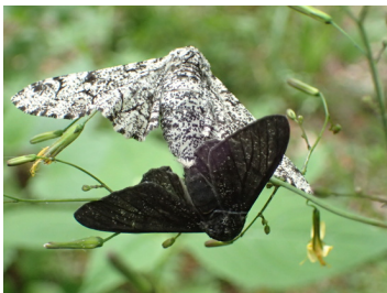
A pair of peppered moths, one each of the light and dark form

Do you think this kind of reductionism is correct, or not? What advantages and disadvantages are produced by an explanation in terms of chemistry, as opposed to a biological explanation? What might this mean for how we think about the relationships between scientific fields?