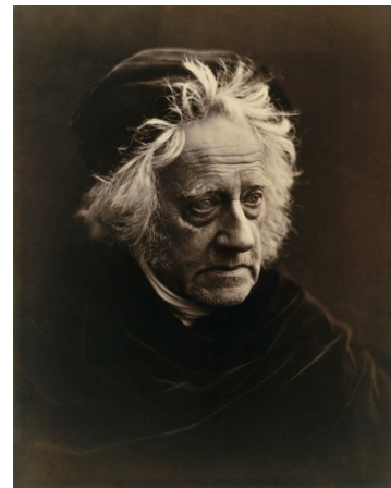
Sir John Herschel, photographed by famed photographer Julia Margaret Cameron